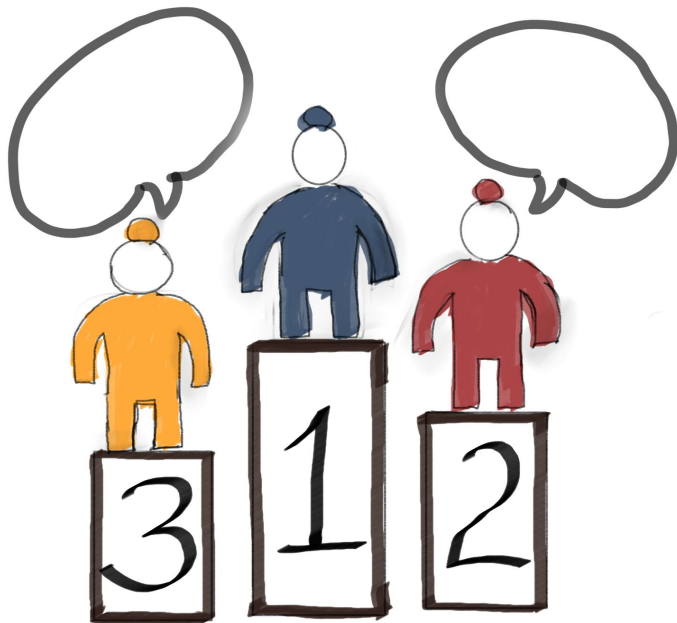
Not Accepting Hukam

Look at the two images below. In the first image, write out what the characters might say if they were not accepting Hukam. In the second image, write out what they might say if they were true Gursikhs and accepting Hukam.